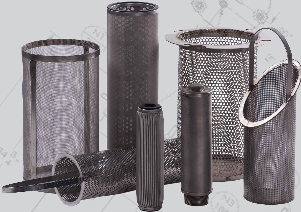
Wedge-wire type strainer

Y type, perforated metal basket, with or W/O wire mesh.